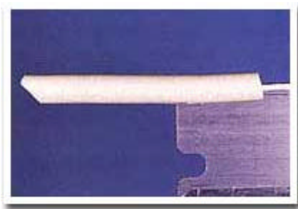
Step 1. Make a slice in the foam, as shown.