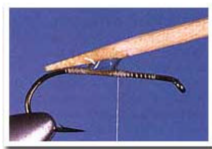
Step 2. Wrap a thread base over the rear half of the hook shank and apply a smear of Zap-A-Gap.